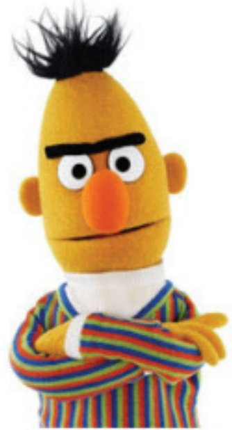
The character Bert is licensed by Sesame Street.

More than ever, your website content must serve potential patients by addressing the topics they are searching for online and the real questions they have-- and that requires high quality, fresh content (blogs, videos, articles...).