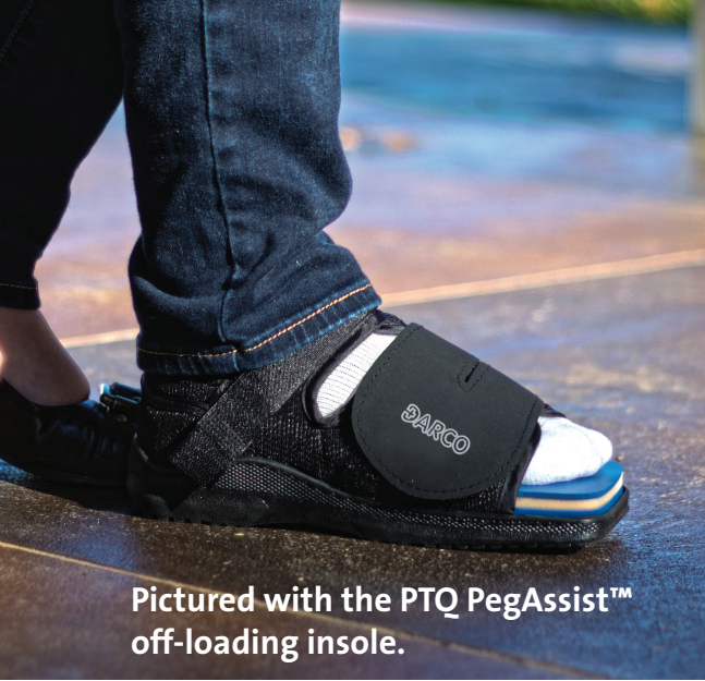
Pictured with the PTQ PegAssist™ off-loading insole.