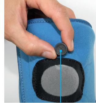
Easy inflation and deflation using an integrated system