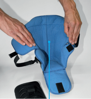
Wide opening for easy foot insertion