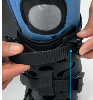
Practical closure system