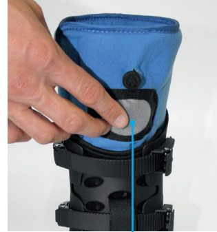
Perfect fit through air compression