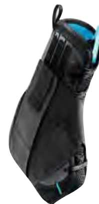
Ankle Brace with Figure 8 Strap