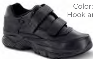
X920M Color: Black Hook and Loop