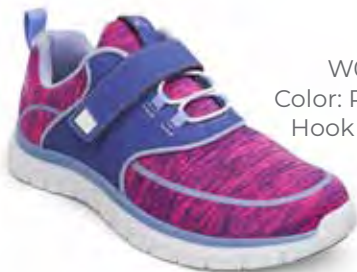
W045-87 Color: Purple/Pink Hook and Loop