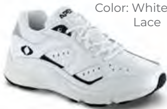
V854M Color: White/Blue Lace