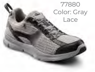
77880 Color: Gray Lace