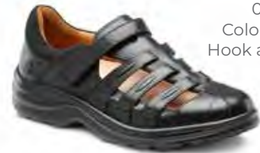
0810 Color: Black Hook and Loop