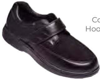
S310-1 Color: Black Hook and Loop