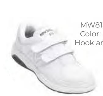
MW813HWT Color: White Hook and Loop