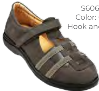
S606-8* Color: Gray Hook and Loop