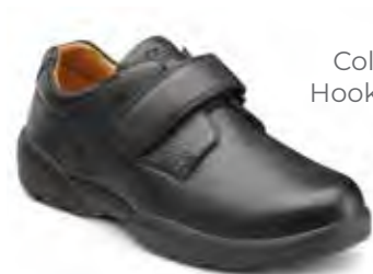
6110 Color: Black Hook and Loop