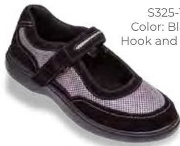
S325-1 Color: Black Hook and Loop