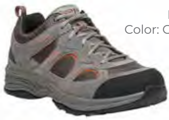
M5503GUO Color: Gunsmoke/Orange Lace