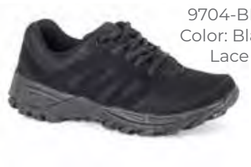
9704-BLK Color: Black Lace