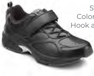
5710 Color: Black Hook and Loop