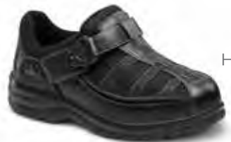
2610 Color: Black Hook and Loop