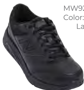
MW928BK3 Color: Black Lace