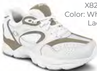
X821M Color: White/Gray Lace