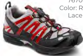
7670 Color: Red Lace