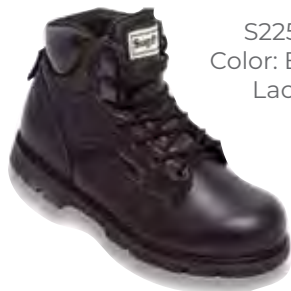
S225-1 Color: Black Lace