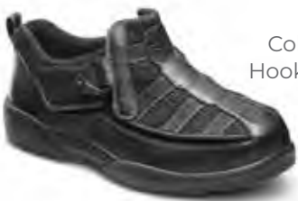
9610 Color: Black Hook and Loop