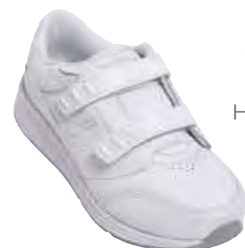
WW928HW3 Color: White Hook and Loop