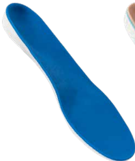
Bi-Laminated EVA Base Accommodative