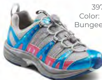
3976 Color: Berry Bungee / Lace