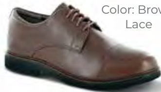
LT610M Color: Brown Lace