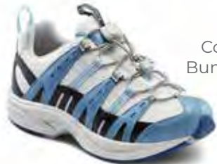
2950 Color: Blue Bungee / Lace