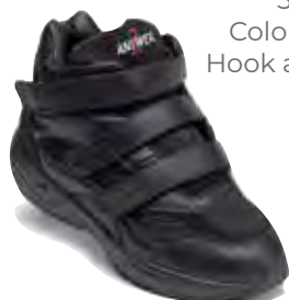
551-1 Color: Black Hook and Loop