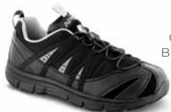
A5000M Color: Black Bungee / Lace