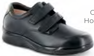
1260M Color: Black Hook and Loop