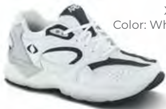
X521M Color: White/Blue Mesh Lace