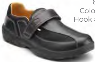
6610 Color: Black Hook and Loop