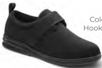
0910 Color: Black Hook and Loop