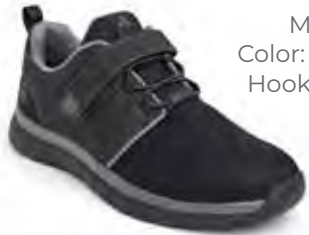
M046-13 Color: Black/Gray Hook and Loop