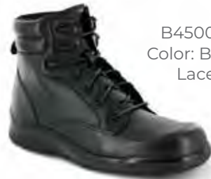
B4500M Color: Black Lace