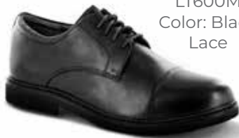
LT600M Color: Black Lace