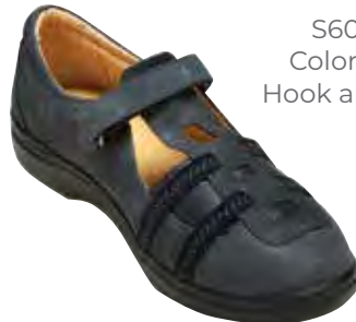
S606-7* Color: Navy Hook and Loop