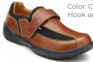
6620 Color: Chestnut Hook and Loop