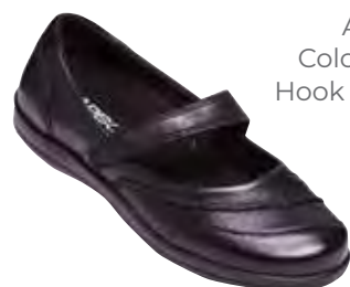
A330 Color: Black Hook and Loop