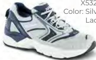
X532M* Color: Silver/Navy Lace