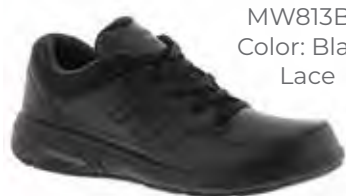
MW813BK Color: Black Lace