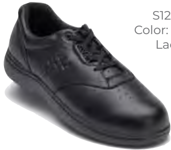
S125-1 Color: Black Lace