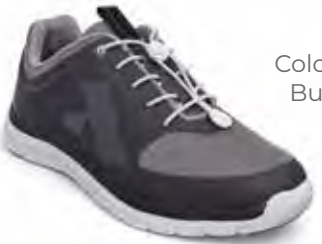
M022-31 Color: Gray/Black Bungee / Lace