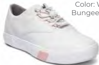
W093-40 Color: White Bungee / Lace