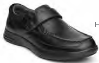
M052-10 Color: Black Hook and Loop