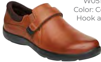
W051-23 Color: Cognac Hook and Loop