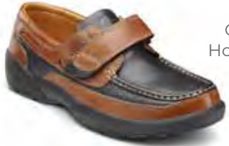
8660 Color: Multi Hook and Loop