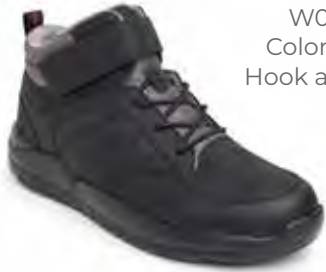
W055-11 Color: Black Hook and Loop