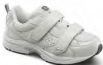
7740 Color: White Hook and Loop