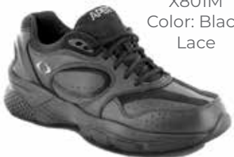
X801M Color: Black Lace