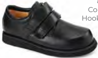
802BK Color: Black Hook and Loop