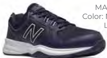
MA411LB1 Color: Navy Blue Lace