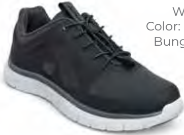
W023-13 Color: Black/Gray Bungee / Lace