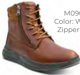
M090-20 Color: Whiskey Zipper / Lace