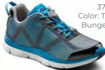
37750 Color: Turquoise Bungee / Lace