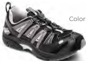
9910 Color: Black/Gray Lace