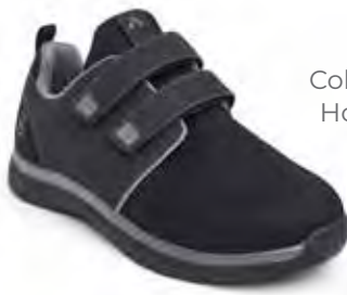
M074-13 Color: Black/Gray Hook and Loop