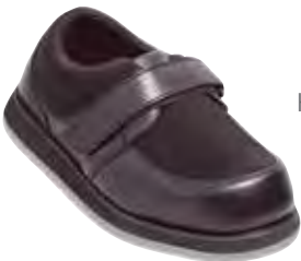
628-E Color: Black Hook and Loop