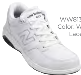
WW813WT Color: White Lace