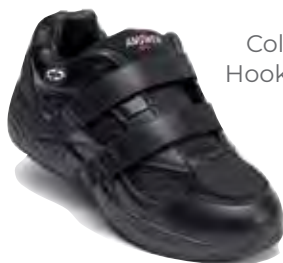
553-1 Color: Black Hook and Loop