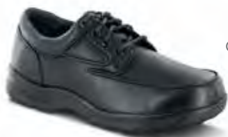
Y900M Color: Black Lace