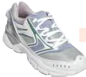
X532W * Color: Silver/Periwinkle Lace