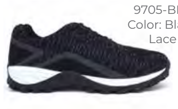
9705-BLK Color: Black Lace