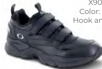
X903M Color: Black Hook and Loop