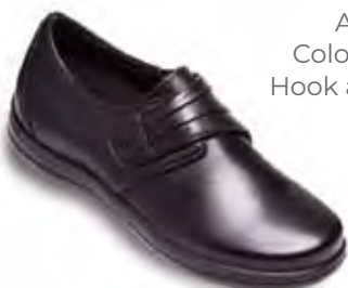
A830 Color: Black Hook and Loop