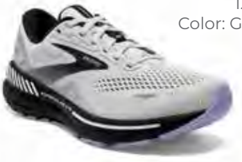
120381-039 Color: Gray/Black/Purple Lace