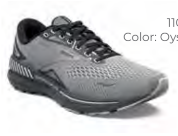
110391-065 Color: Oyster/Ebony/Alloy Lace