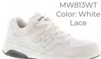
MW813WT Color: White Lace