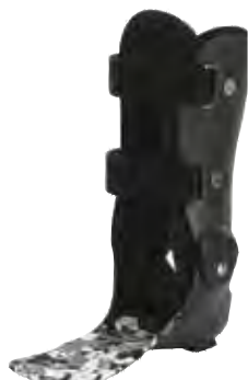
Sure-02 Pro Custom