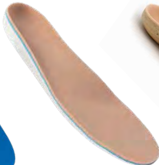
Tri-Laminated EVA Base Accommodative