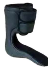
Sure-19 Intersect-Stabilizer Brace