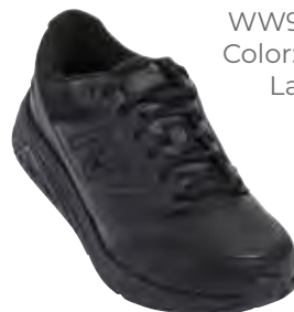
WW928BK Color: Black Lace