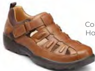
9820 Color: Chestnut Hook and Loop