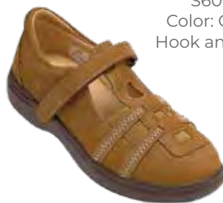
S606-2 Color: Camel Hook and Loop