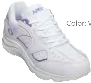
V854W Color: White/Periwinkle Lace