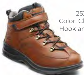
2520 Color: Chestnut Hook and Loop