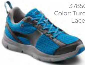
37850 Color: Turquoise Lace