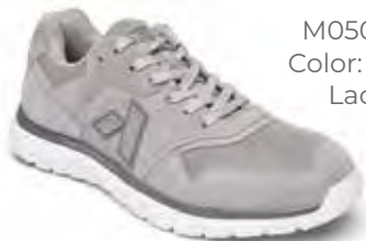
M050-32 Color: Gray Lace