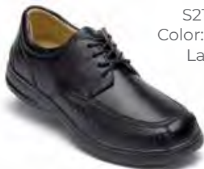
S215-1 Color: Black Lace