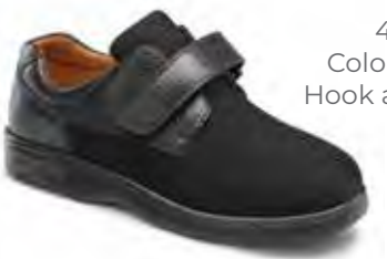
4510 Color: Black Hook and Loop