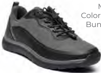
M016-10 Color: Black/Gray Bungee / Lace