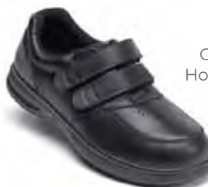
S116-1 Color: Black Hook and Loop