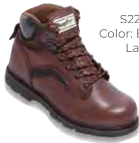
S225-2 Color: Brown* Lace