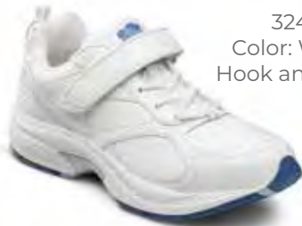
3240 Color: White Hook and Loop