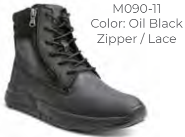
M090-11 Color: Oil Black Zipper / Lace