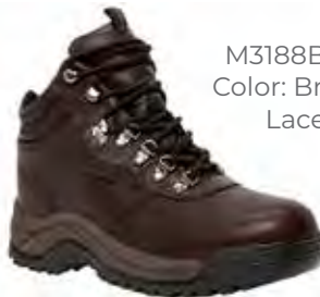
M3188BRO Color: Brown Lace