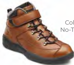
9420 Color: Chestnut No-Tie Elastic Lace