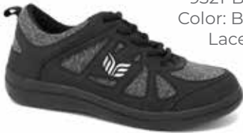
9321-BLK Color: Black Lace