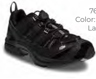
7611 Color: Black Lace