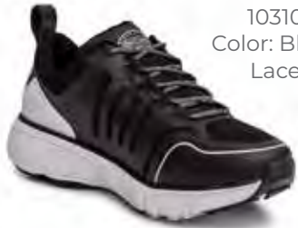
10310 Color: Black Lace