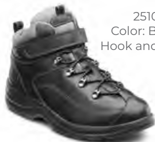
2510 Color: Black Hook and Loop