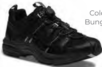
3910 Color: Black Bungee / Lace