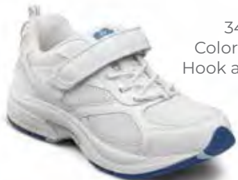
3440 Color: White Hook and Loop