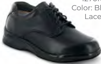
1270M Color: Black Lace