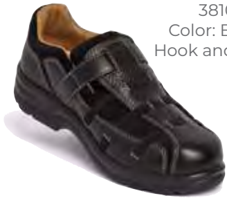
3810 Color: Black Hook and Loop