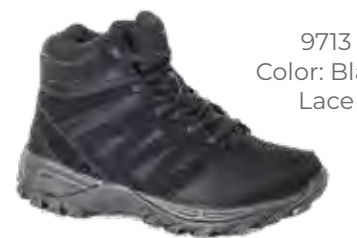
9713 Color: Black Lace