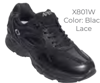
X801W Color: Black Lace