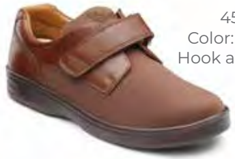
4520 Color: Brown Hook and Loop