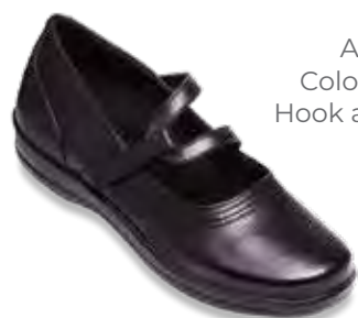
A300 Color Black Hook and Loop