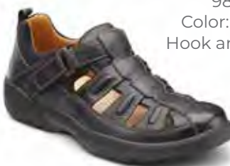
9810 Color: Black Hook and Loop