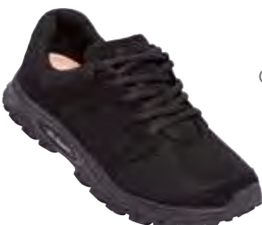
9306-BLK Color: Black Lace