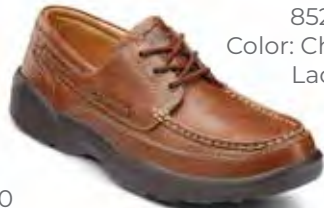
8520 Color: Chestnut Lace