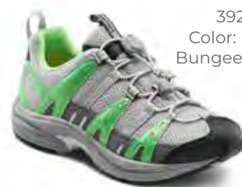
3925 Color: Lime Bungee / Lace