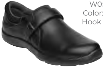
W051-10 Color: Black Hook and Loop