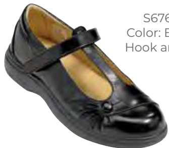
S676-1 Color: Black Hook and Loop