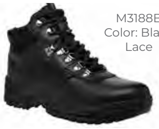
M3188B Color: Black Lace