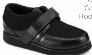
728-E-BLK Color: Black Hook and Loop