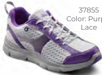
37855 Color: Purple Lace