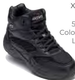
552-1 Color: Black Lace