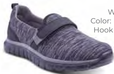
W011-13 Color: Black/Gray Hook and Loop