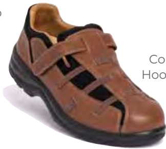
3820 Color: Brown Hook and Loop