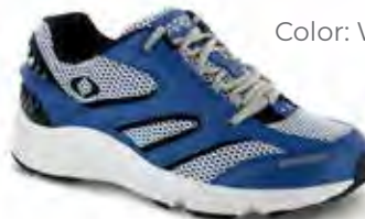
V551M* Color: White/Blue Mesh Lace