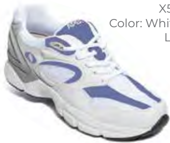
X521W Color: White/Blue Mesh Lace