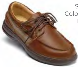
S175-2 Color: Brown Lace