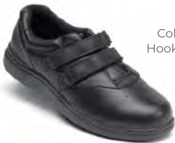
S136-1 Color: Black Hook and Loop