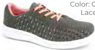
9327-GRY Color: Gray Lace