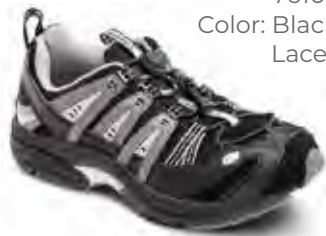
7610 Color: Black/Gray Lace