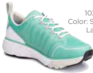
10325 Color: Seafoam Lace