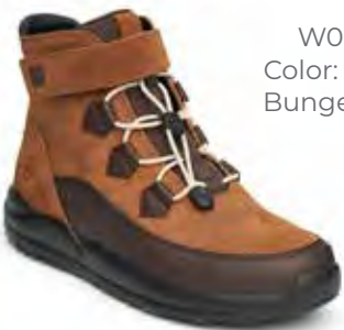
W089-26 Color: Almond Bungee / Lace