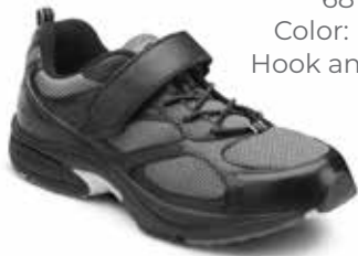
6810 Color: Black Hook and Loop