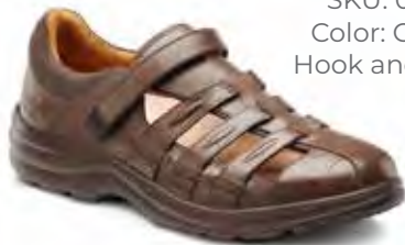
SKU: 0820 Color: Coffee Hook and Loop