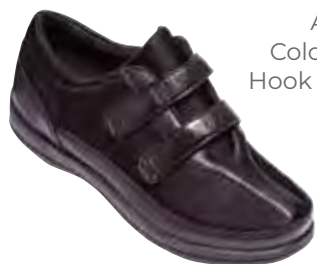
A730 Color: Black Hook and Loop