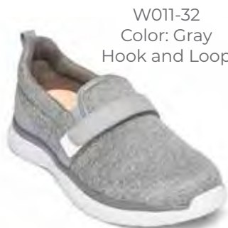
W011-32 Color: Gray Hook and Loop