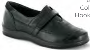
A700W Color: Black Hook and Loop