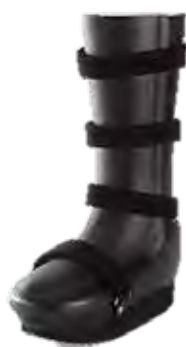
Sure-07 Crow Boot