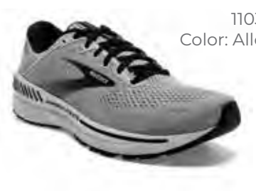
110366-012 Color: Alloy/Gray/Black Lace