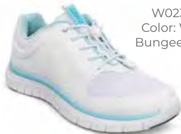
W023-45 Color: White Bungee / Lace