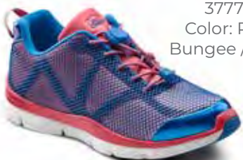
37770 Color: Pink Bungee / Lace