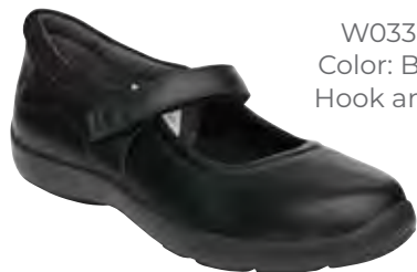
W033-12 Color: Black Hook and Loop