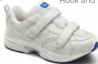
2440 Color: White Hook and Loop