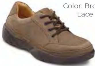
5520 Color: Brown Lace