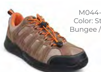
M044-30 Color: Stone Bungee / Lace