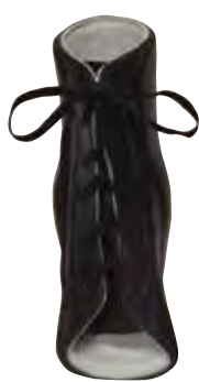
Sure-14 Standard Solid Ankle