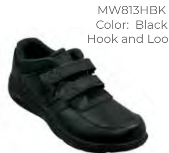
MW813HBK Color: Black Hook and Loop