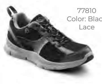
77810 Color: Black Lace