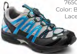
7650 Color: Blue Lace