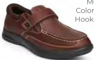
M052-20 Color: Whiskey Hook and Loop