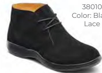
38010 Color: Black Lace