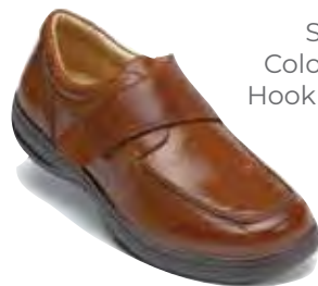
S196-2 Color: Camel Hook and Loop