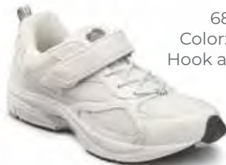
6840 Color: White Hook and Loop