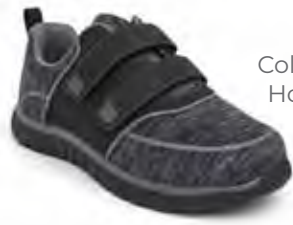
W077-13 Color: Black/Gray Hook and Loop