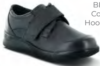
BIO3000M Color: Black Hook and Loop