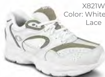
X821W Color: White/Gray Lace