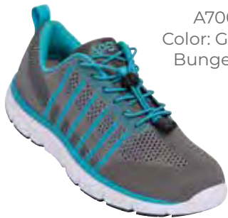
A7000W Color: Gray/Blue Bungee/Lace