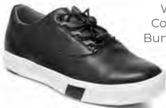
W093-10 Color: Black Bungee / Lace