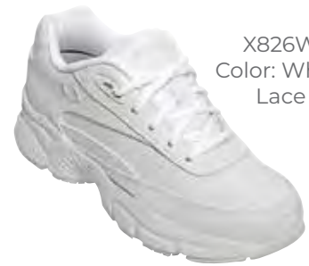
X826W Color: White Lace