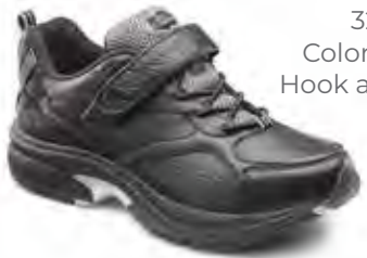
3210 Color: Black Hook and Loop