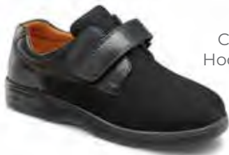
4910 Color: Black Hook and Loop