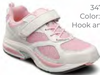
3470 Color: Pink Hook and Loop