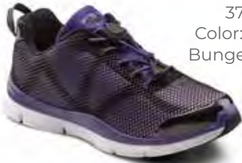
37755 Color: Purple Bungee / Lace