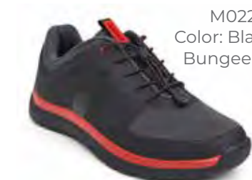
M022-16 Color: Black/Red Bungee / Lace