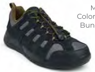
M044-15 Color: Dark Gray Bungee / Lace