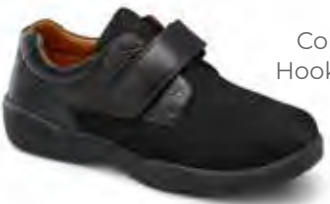
6910 Color: Black Hook and Loop