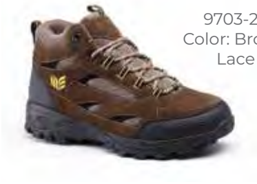
9703-2L Color: Brown Lace