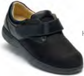
S626-1 Color: Black Hook and Loop