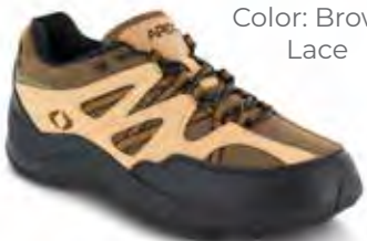
V751M Color: Brown Lace