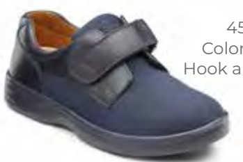
4550 Color: Blue Hook and Loop