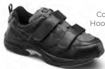
7710 Color: Black Hook and Loop