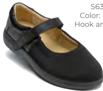
S636-1 Color: Black Hook and Loop