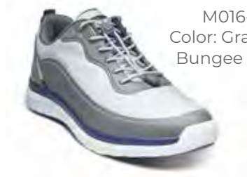
M016-32 Color: Gray/Blue Bungee / Lace