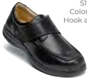
S196-1 Color: Black Hook and Loop