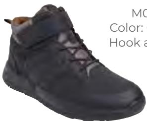
M056-11 Color: Oil Black Hook and Loop