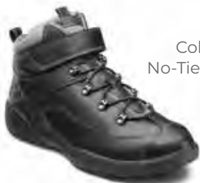
9410 Color: Black No-Tie Elastic Lace