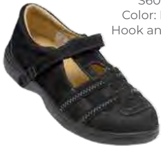
S606-1 Color: Black Hook and Loop