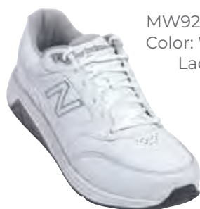
MW928WT3 Color: White Lace