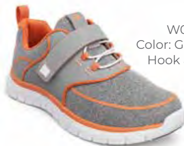
W045-39 Color: Gray/Orange Hook and Loop