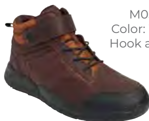
M056-20 Color: Whiskey Hook and Loop