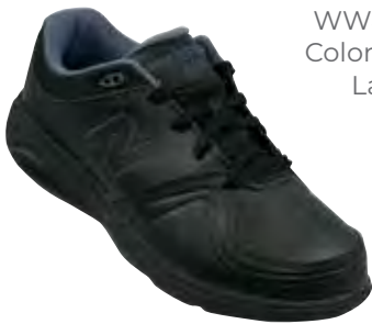
WW813BK Color: Black Lace