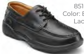
8510 Color: Black Lace