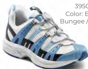
3950 Color: Blue Bungee / Lace