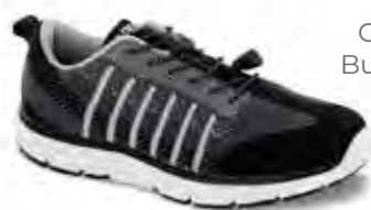
A7000M Color: Black Bungee / Lace