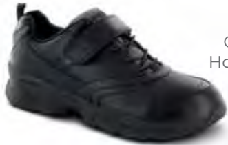
A6000M Color: Black Hook and Loop