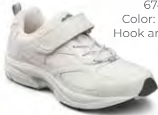
6740 Color: White Hook and Loop