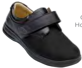
S166-1 Color: Black Hook and Loop