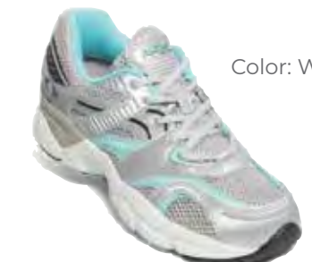
X527W Color: White/Aqua Mesh Lace