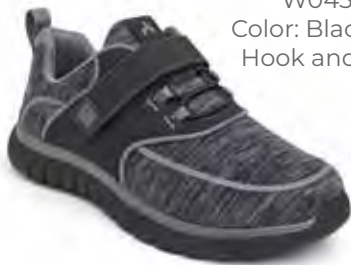
W045-13 Color: Black/Gray Hook and Loop