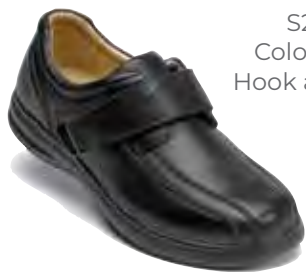
S206-1 Color: Black Hook and Loop