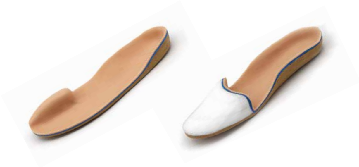
Toe Fill Orthotics for Hallux, Trans Metatarsal and Multi-Toe Amputations