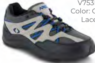
V753M Color: Gray Lace