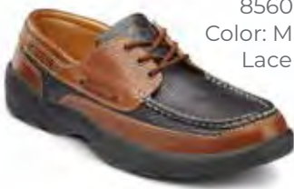
8560 Color: Multi Lace