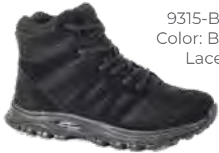
9315-BLK Color: Black Lace