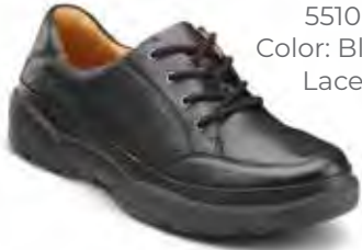
5510 Color: Black Lace