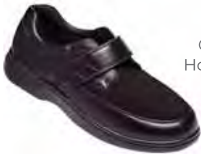
S320-1 Color: Black Hook and Loop