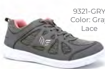
9321-GRY Color: Gray Lace