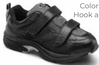
2410 Color: Black Hook and Loop