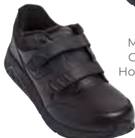
MW928HB3 Color: Black Hook-and-loop