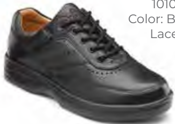
1010 Color: Black Lace