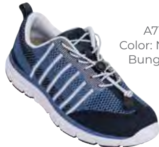
A7100W Color: Navy/Blue Bungee/Lace