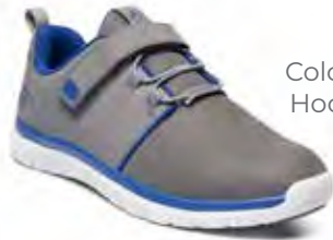
M046-35 Color: Gray/Blue Hook and Loop