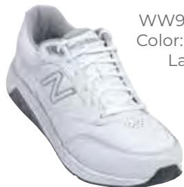
WW928WB Color: White Lace